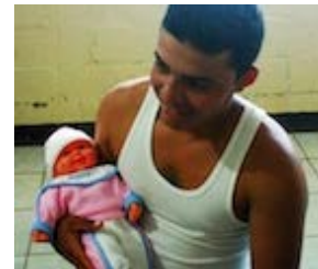
Support MenCare's Dolls for Dads Project on Catapult. Donate here!