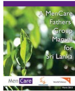
A MenCare Father's Group Manual for Sri Lanka is available for download here .