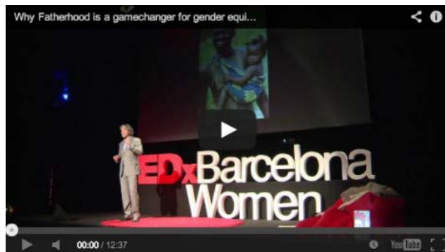
(Click on the image to watch)

"Caregiving is serious. It is neither male nor female. It is simply what makes us human."