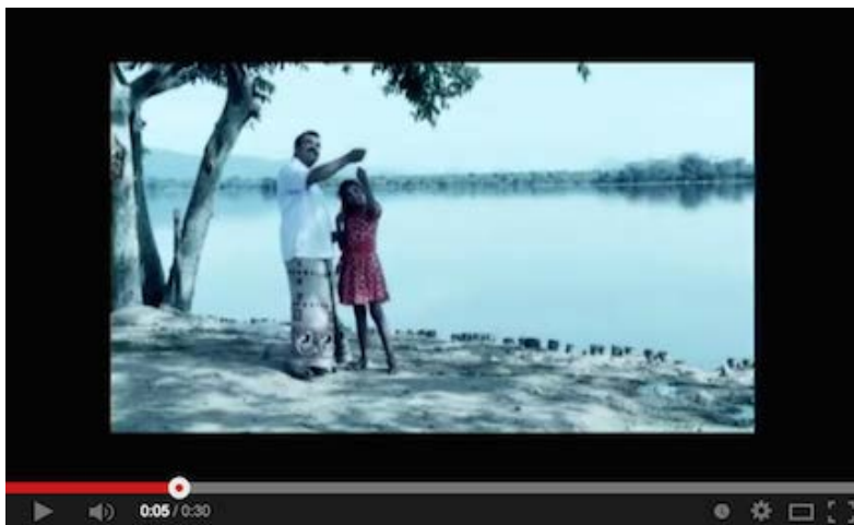
Sinhala Video ( Click to watch )

The two videos were created in the two official languages of Sri Lanka to ensure that every Sri Lankan can understand them. The videos show how the involvement of fathers as caregivers for their children brings benefits to women, children and men themselves. Click to watch the videos below!