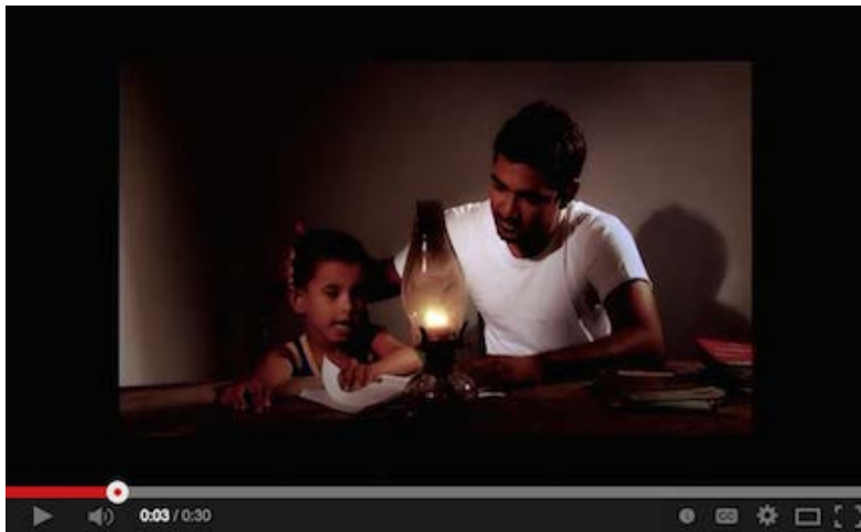
Tamil Video ( Click to watch )

Read more about MenCare Sri Lanka's TV spots here , and learn more about MenCare Sri Lanka here .